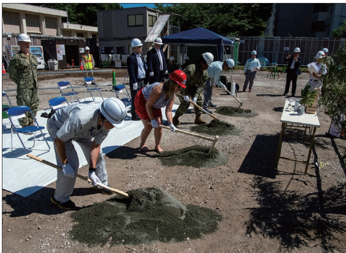
Members from Commander, Fleet Activities Yokosuka (CFAY) take part in at the ground breaking ceremony for the new activity and recreation center at the Ikego Housing Area.

The reinforced concrete construction of the soon-to-be Living Support Facility is expected to host a School Age Care (SAC) Center, a Youth Center, a Teen Center, multi-purpose community rooms and common areas, a kitchen, a music room, a laundromat, and office space. The facility