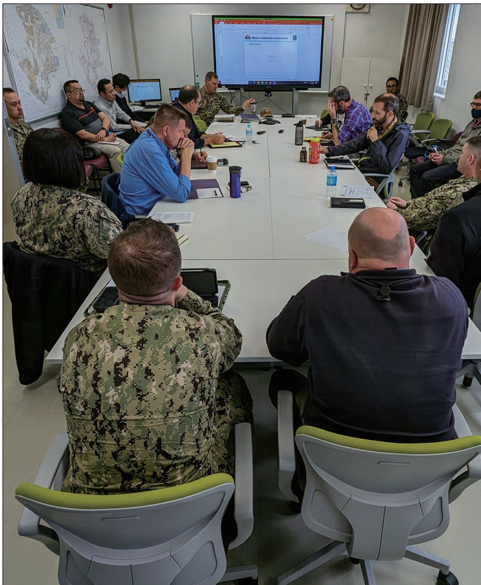
Members of Commander, Fleet Activities Yokosuka (CFAY) participated in an Energy Resilience Readiness Exercise (ERRE) Tabletop Exercise (TTX) to identify critical mission readiness gaps and develop strategies for enhancing the reliability, resilience, and efficiency of shore assets vital to national defense.

most critical mission impacts. Helping supported commands identify facility requirements and understanding the mission impacts ensures the LRMP uses available resources most effectively.